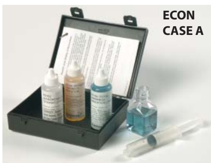
ECON CASE A