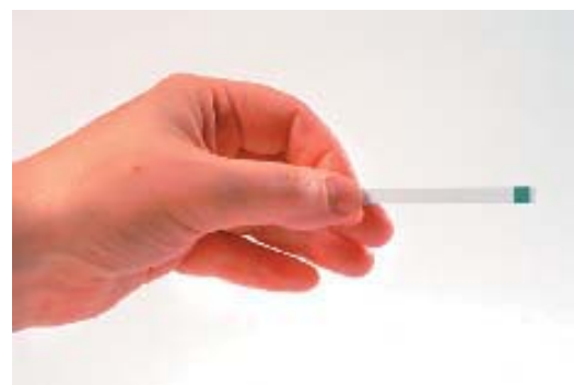
Hydrogen Peroxide Test Strip

Black Plastic Case containing: Silver test kit (25 tests) Hydrogen Peroxide Test Strips (100 tests) Hydrogen Peroxide Drop Test (65 tests) Sample jar and syringe Instruction Booklet