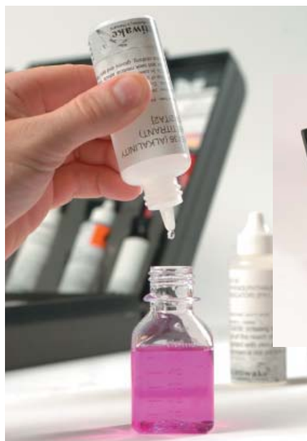
Hydrogen Peroxide Test Set