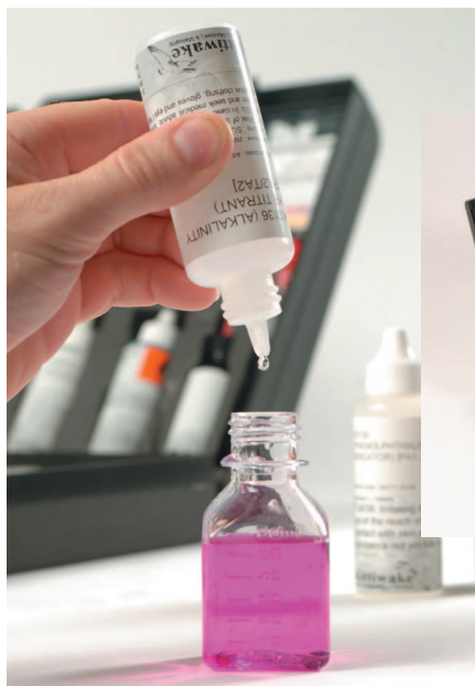
Hydrogen Peroxide Test Set

Range: 10-100 ppb Ag + 0.5-100 ppm H 2 O 2 5.0-500 ppm H 2 O 2 Detection: Silver ions & hydrogen peroxide Application: Silver/Peroxide product analysis Accuracy: to 10 ppb Ag + & 0.5/5ppm H 2 O 2 Resolution: 10, 20, 40, 75, 100 ppb Ag + 0.5,2,5,10,25,50,100 ppm H 2 O 2 5ppm per drop H 2 O 2 Size: 340 mm x 270 mm x 80 mm Weight: 1.5 kg