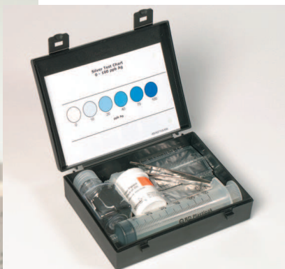
Silver Test Set