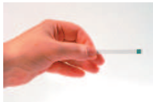
Hydrogen Peroxide Test Strip

FG-K28463-KW: Silver/Peroxide Test Kit Black Plastic Case containing: Silver test kit (25 tests) Hydrogen Peroxide Test Strips (100 tests) Hydrogen Peroxide Drop Test (65 tests) Sample jar and syringe Instruction Booklet