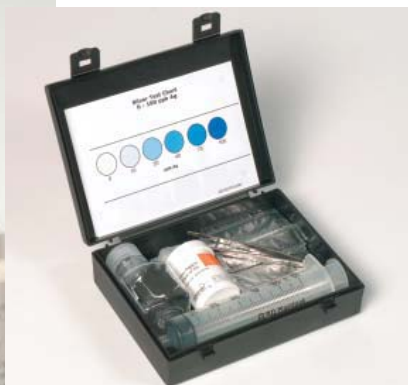
Silver Test Set